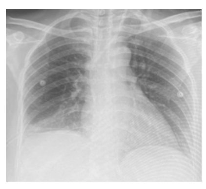
Figure 3: Chest radiograph showing significantly reduced right pleural effusion with intercoastal drainage tube insitu (white arrow) and CVC in left IJV (black arrow).