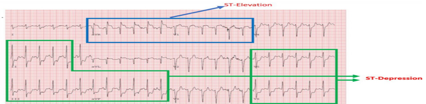
Figure 2: Treadmill Exercise stress test ECG showing ST-segment elevation of >5mm in aVR lead and V1 lead with ST-depression in inferior-lateral leads during the peak phase

The ST elevation in aVR lead to raised concern for left main disease and the patient underwent emergent cardiac catheterization. The Exercise ECG testing in patients with significant AS not emergent cardiac catheterization demonstrated 20% discrete lesion infrequently can cause ST segment depression due to left of both LMCA and LAD with total occlusion of right coronary ventricular hypertrophy. But ST-elevation is not common [7]. We artery (RCA). This was also confirmed by Fractional flow reserve present an unusual case with moderately severe AS with single (FFR) (Figure: 3, Video: 2).