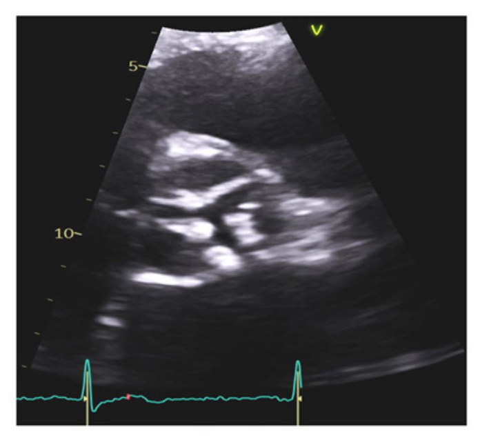
Figure 1: Transthoracic echocardiography showing aortic valve in parasternal short axis view.

Transthoracic echocardiogram revealed moderate to severe calcific AS and mild–moderate aortic regurgitation with AV area of 1.32 cm<sup>2</sup> and AV mean gradient of 35 mmHg and normal left ventricular ejection fraction (Figure: 1, Video:1).