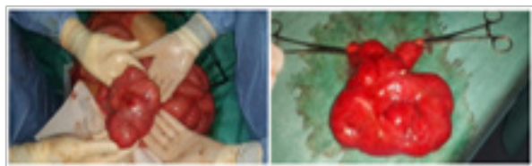
Figure 2: Hail mass before and after resection.