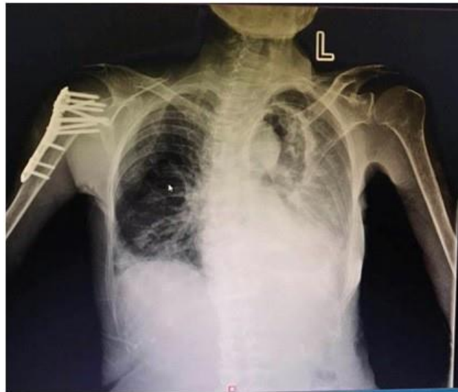
Figure 1: Chest X-ray taken before operation: the left pleural effusion is more than before. Some pleural effusion on the right side, some infiltration on the lower right lung.

gastroesophageal rebuild then. Since then she recovered very well, and only remained the impaired appetite and the weight loss. In her lifetime she had no symptoms of reflux or flatulence. This time she suffered from a traffic crash and was submitted to hospital. She was diagnosed as multiple fractures, postoperative esophageal cancer, mild anemia, hyperglycemia, moderate malnutrition, hypoproteinemia. At first, she received a surgery on humerus and tibiofibular in ER, and stepped into a temporary stable condition. One week later, she was submitted to OR for a fixation of femoral neck fracture again. This time she had enough fasting period before operation. The day before the second surgery when the primary resident anesthesiologist executed the preoperative visit, the thoracic CT examination was not in her document and the resident only checked the thoracic X-ray, ECG assessment, CT examination around hip joint, and some other basic blood examinations. The thoracic X-ray report was bilateral pleural effusion and pulmonary infection, as shown in (Figure 1).