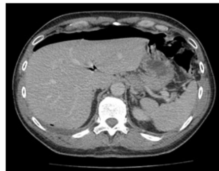
Figure 1: CT scan that shows free air under the right diaphragm without other signs of JID perforation.

According to the new clinical conditions, we decided to make an abdominal CT scan that showed free air under the right diaphragm but didn't show free liquid in the abdomen (Figure 1); the mechanical rectal suture was complete, and the CT scan didn't show free air in the mesorectal and pelvic area (Figure 2).