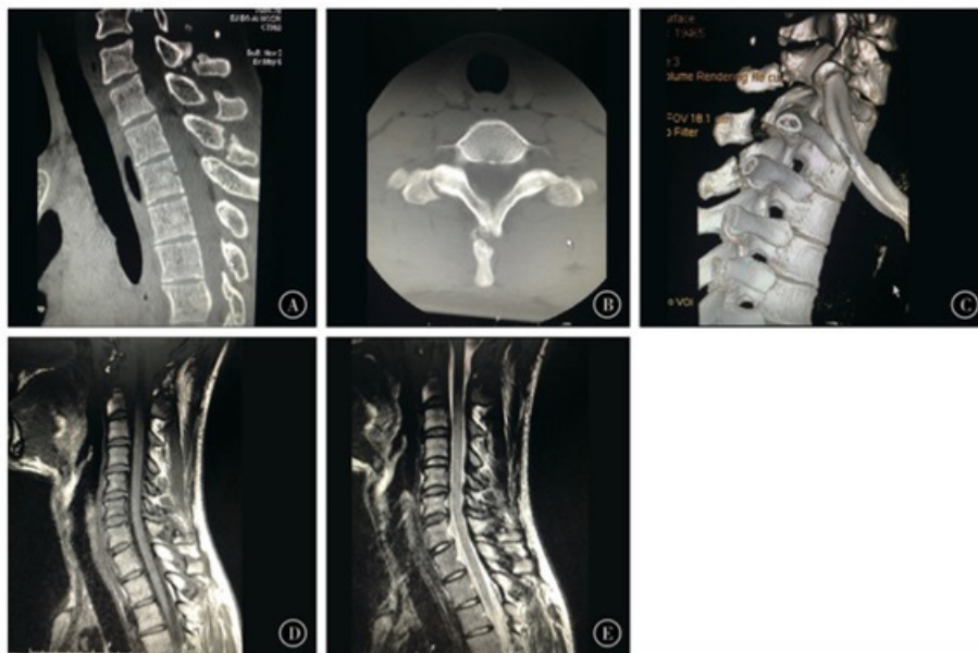
Figure 2: The results of imaging after 2 years of follow-up A. Cervical spine CT sagittal showed C7, T1, T2 spinous process fractures did not heal. B Cervical spine CT axial position showed spinous process fractures did not heal. The medullary cavity was closed and the fracture ends were separated. C 3D reconstruction of the cervical spine CT shows C7, T1, T2 spinous process fractures unhealed D cervical sagittal MRI T1 weighted image shows C7, T1, T2 spinous process unhealed E cervical sagittal view MRI T2 weighted image shows C7, T1, T2 spinous process fractures unhealed.